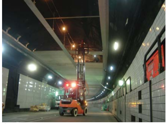
▲ Ceiling panels are being replaced (Moji area)

It has been fifty-one years since the roadway tunnel opened already. Thus, a three-year renovation project has been implemented to prevent that tunnel from deterioration over time since 2008, in which the closures of the entire tunnel are needed to carry out works. In the first year of that program, engineers worked around the clock to replace precast concrete panels on the ceilings of the total 2,682-meter-long ground sections and completed that in sixty days during which the tunnel was closed.