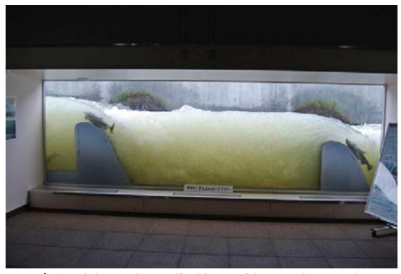
▲ A Fishway is studied in an Observation Tank. (Photos and essay by Akira Usami, Hokkaido Regional Development Bureau, MLIT)