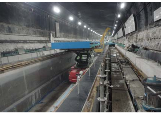
▲ FRP PC panels are transferred