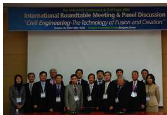
International Roundtable Meeting participants, Oct 30, 2008