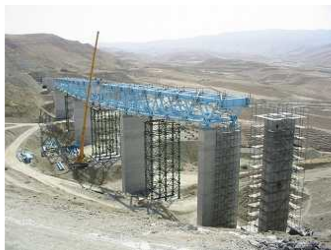
Picture 3. No.3 Bridge