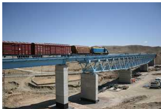
Picture 2. No.2 Bridge