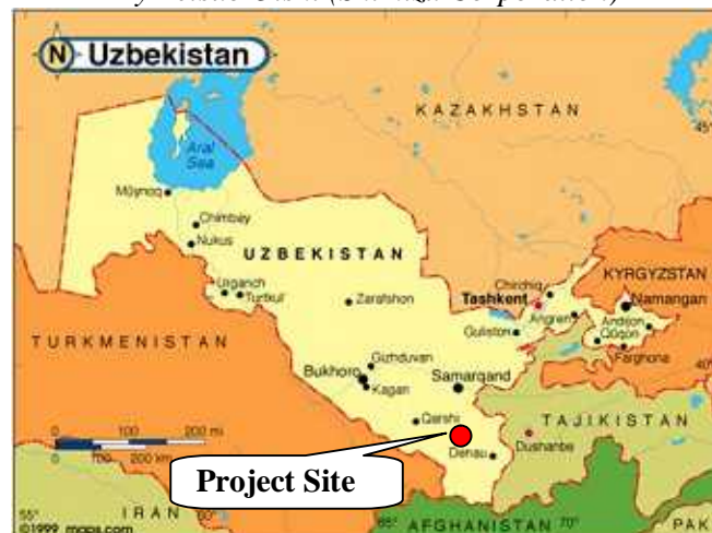
Picture 1. Site location