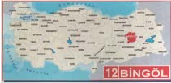
Location of Bingöl Province

An earthquake with a magnitude of 6.4 ( M_w ) occurred on May 1, 2003 in Bingöl province located in the East Anatolian Region of Turkey. This earthquake was officially called Bingöl Earthquake and was felt at neighbouring cities. This province was also hit by an earthquake, which occurred in 1971 and caused heavy damages and loss of life particularly in Bingöl. The Kandilli Observatory and Earthquake Research Institute (KOERI, 2003) of Bogaziçi University estimated that the earthquake was centred at 39.01 N and 40.49 E, which places its epicentre about 15 km NW of Bingöl city.