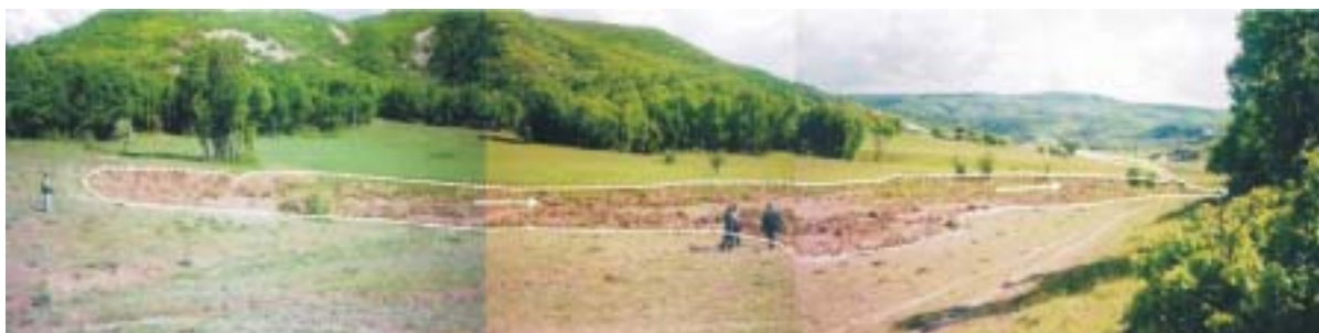
Large lateral spread induced by soil liquefaction at Hanocayiri

Landslides and a large lateral spreading triggered by the earthquake also occurred. Landslides were mainly in the mode of earth flows in highly weathered volcanics and rock falls from steep slopes, which were observed in rural areas. Focal plane solutions from several institutes indicate two possible strike-slip faults striking NW-SE and NE-SW. On the contrary to those observed in the devastating 1999 Kocaeli and Düzce earthquakes of Turkey, evident surface rupture could not be traced on the land in this earthquake. However, very short and thin cracks observed at a location in the epicentral area are considered to be associated with the possible causative fault.