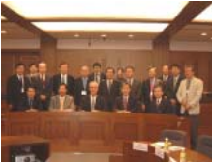
Attendees of the Roundtable Meeting

The participating societies agreed upon the need for a high quality English journal that would be internationally recognized and agreed to consider this issue within their respective societies.