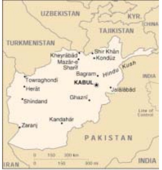
Map of Afghanistan