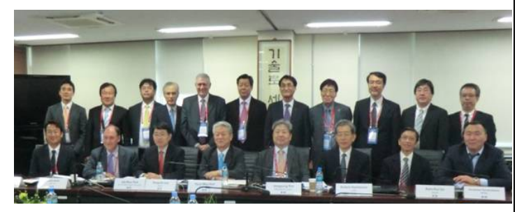
KSCE Int'l Roundtable Meeting Participants

http://committees.jsce.or.jp/kokusai/node/33.