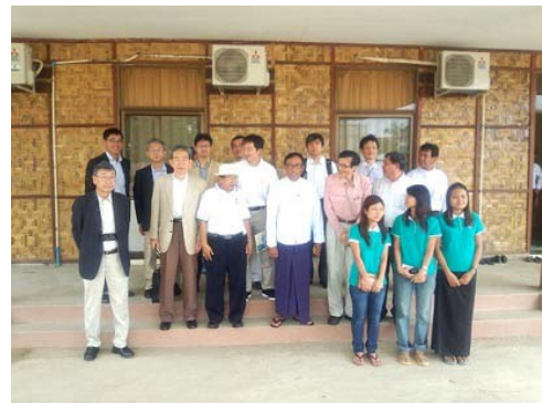
The JSCE delegation and project members of MoT for the bridge construction.