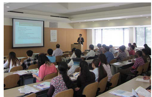
A company rep talks his company activity.