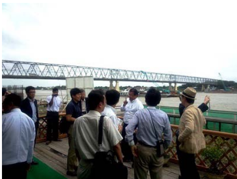
The JSCE delegation visits a bridge construction site.