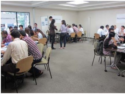
Int'l students meet company reps.

fairs nowadays. The International Students Network Group first conducted a questionnaire survey to construction companies to see their interests in the event, and then decided to hold it. Also, some international students wanted to get information or job in Japanese construction companies.