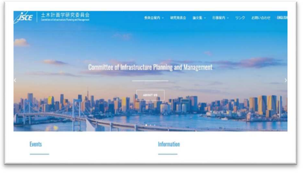
Committee of Infrastructure Planning and Management Website (https://jsce-ip.org/)

The 'environment' in which we live is created by manipulating the natural environment with our hands in various ways. In other words, it is only through the development of 'infrastructure' such as roads and railways, ports and airports, water and sewage systems, parks, and dams and embankments that the environment of cities and regions that we have become accustomed to is created. Infrastructure planning and management is an academic discipline that considers how we should establish the 'environment' of our lives through the