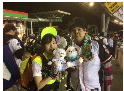
With Beer Girl in Metlife Dome in Saitama

The last reason that I enjoy here is that my hobby also fits well. Because I like travel very much, and Japan has many good spots. The planning and information of travel industry are always fantastic here, making it easier and enjoyable to travel in Japan. I am planning to complete the goal of traveling around all the 47 prefectures in Japan. Another hobby I enjoy is watching baseball games. I often went to baseball games in Taiwan and U.S.A., but I have found there are some special and interesting baseball cultures in Japan. For instance, the ways that baseball fans support their team are very special. There are many songs to support