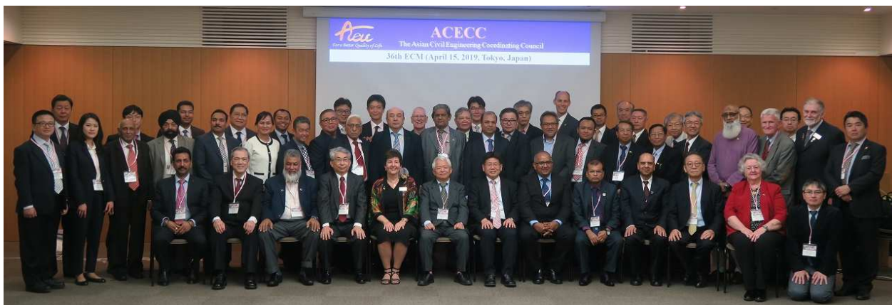
All Participants of Executive Committee Meeting

strengthen collaboration with the JSCE International Activities Center.