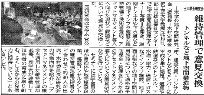
Article on the 8th Maintenance Seminar on Underground Space