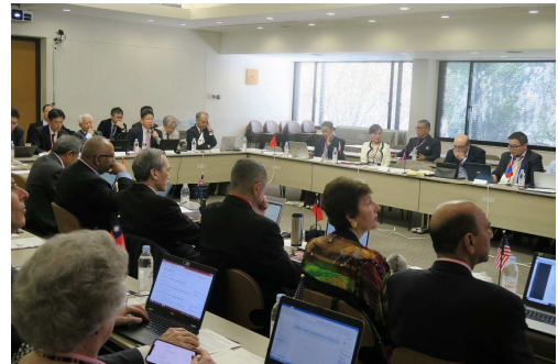
Executive Committee Meeting

The 36th Executive Committee Meeting (ECM, the supreme decision-making body of the ACECC) was held at the JSCE Hall in Yotsuya, Tokyo on April 15, one day before the Civil Engineering Conference in the Asian Region (CECAR) which is held once every three years. After CECAR7 (held in Hawaii) until CECAR8 (held this year in Tokyo), the ACECC had been administered by the administrative organization in which Japan Society of Civil Engineers (JSCE) plays a leading role. The administrative organization is comprised of ACECC Chairperson