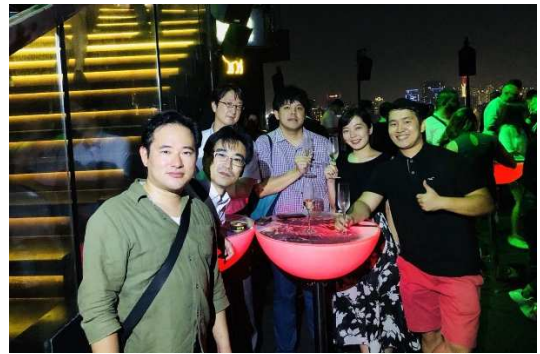
Went to Vietnam for International Conference with Members in Laboratory.

Firstly, I would like to share my university life in my laboratory with members. Most members in the laboratory are Japanese students; hence, it was difficult to get closer when I first joined the laboratory since my Japanese was very poor when I came to Tokyo. Although Japanese people are very shy and not so willing to use English, they are very kind to foreign students and help me a lot even carrying on communication in only English or Japanese is not easy. So now, I have many friends in the laboratory, we keep in contact and often get together even after their graduation. My professor is very kind to me and the relation among all the members is very good, that makes my life in the laboratory happy.