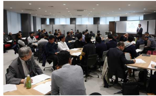
The 8th Disaster Prevention and Disaster Reduction Seminar on Underground Space