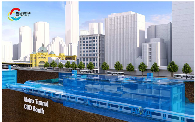
Fig.2 Melbourne Metro Project (from Herald Sun, 2018)

Construction in this environment necessitates highly skilled techniques and extensive experiences to deal with problems in a congested area which are familiar to Japanese engineers who are used to working in busy urban areas like the Tokyo metropolitan area registering an enormous population. For instance, the new Melbourne metro line attracts exceptional attention because it passes through the forest of historical buildings in the middle of the city as