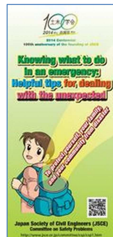
Disaster-Prevention Leaflet (Japanese and English Version)