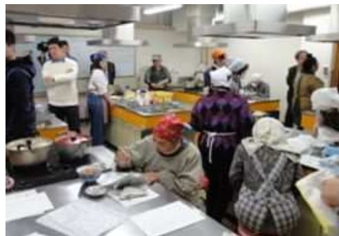
Workshop for Citizens

In recent years, we have been holding workshops targeting citizens using disaster-prevention leaflets prepared by the Committee. Numerous topics, such as first aid and making paper tableware using household items, and methods of safety confirmation at the time of disaster, are summarized in this useful leaflet for citizens. Held in Takatsuki City, Osaka, the workshop invites participants as well as lecturers to practice what was discussed.