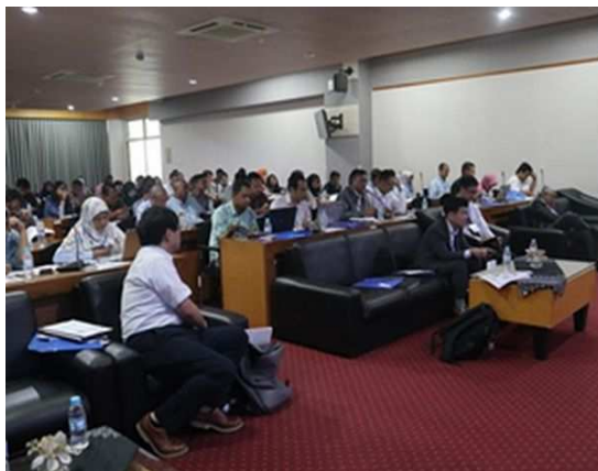
The Audience at the Seminar