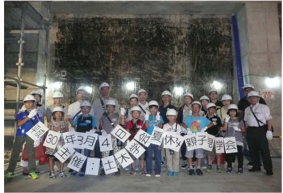
Photo 1 The 12th Parent-Child Site Visit (Osaka Venue: Improvement Work of Hanshin Electric Railway Umeda Station)

The second part of our report describes in detail the promotional activities utilizing the mass media, which is another method. Please don't miss it!