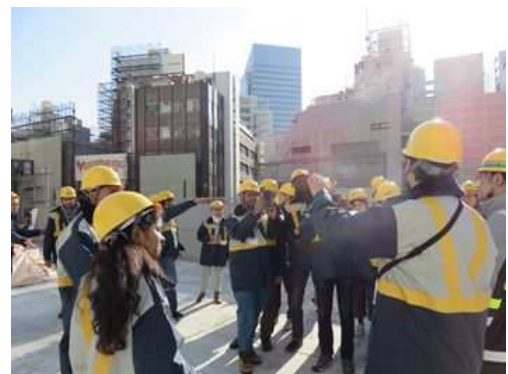
Photo 3 Participants listen to the explanation of how to move all materials into the site