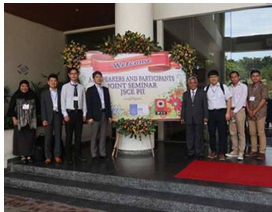
Speakers and ITS Organizers