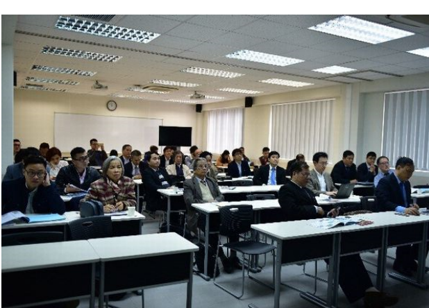
The participants attentively listen to the seminar