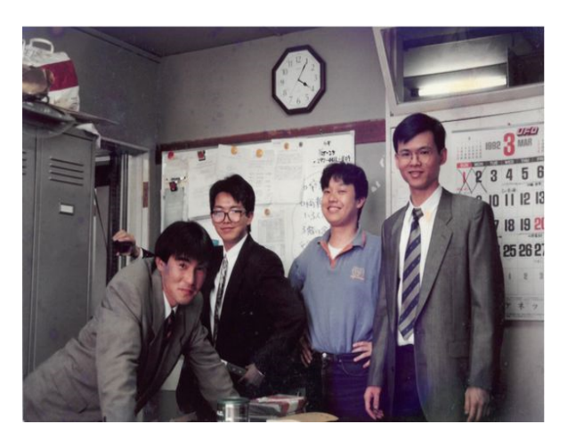
1992 @ Coastal Engineering Laboratory (Author at right)

As there already have numerous detailed reports from Japanese Research Centres and Consultants in regards to Malaysia current economical and political issues, I would like to share here a few of my personal experiences and opinions on Japanese company issues in Malaysia.