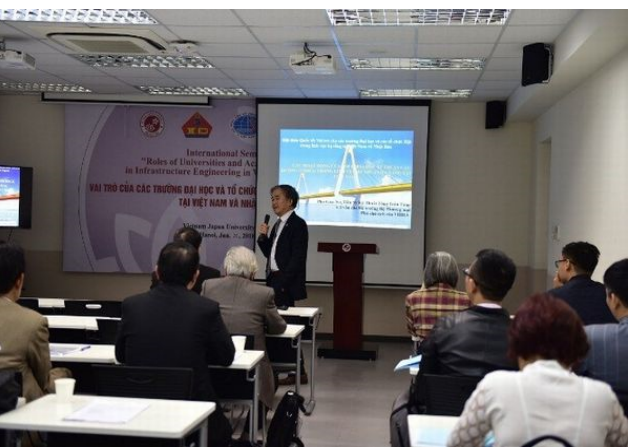
Presentation by VIBRA