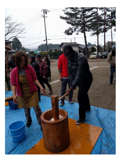
Learning how to pound Motchi in Nagano