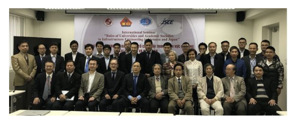
Attendants of the seminar

In the morning of January 20, 2018 (Sat.), an international seminar was held by Master Program in Infrastructure Engineering (MIE) of Vietnam Japan University (VJU) to discuss roles of universities and academic societies in infrastructure engineering in Vietnam and Japan at My Dinh campus of VJU. This seminar was officially supported by Japan Society of Civil Engineers (JSCE), Vietnam Federation of Civil Engineering Associations (VFCEA), and Vietnam Bridge and Road Association (VIBRA).