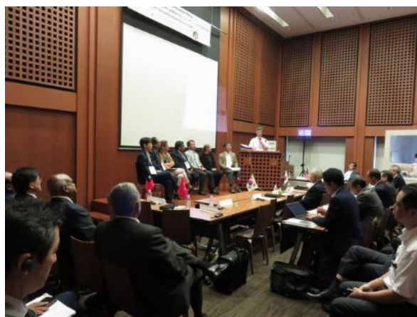
The Speakers and the audience had discussions at the RTM