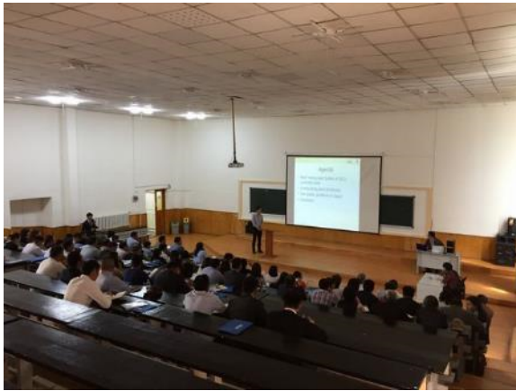
Presentation at the Joint Seminar