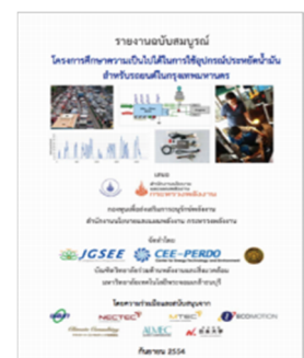
The Idling-Stop Project Report

The first project is a Feasibility Study of Using the Idling Stop Devices for Vehicles in Bangkok, which was a collaborative project with Japanese companies to install an energy saving equipment namely “Eco-Starter” into Bangkok's buses. This project was a testing project aimed to realize energy saving from traffic congestion in Bangkok. This project was funded by the Energy Policy and Planning Office, Ministry of Energy of Thailand, in October 2010 and successfully completed in September 2011. Three Japanese companies were involved in this project, namely Ecomotion, Climate Consulting, and Almec. Prof. Dr. Atsushi Fukuda of Nihon University my