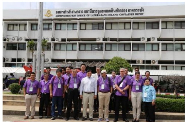
APERC’s Peer Review Team Visit to Thailand