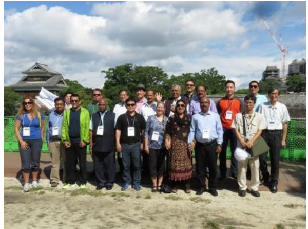
Technical Tour participants

On the 2nd day, the Technical Tour visited the Aso Ohashi Bridge reconstruction area and Kumamoto Castle where had been severely damaged by 2016 Kumamoto Earthquake. In the Aso Ohashi Bridge area, international guests were shocked at seeing the fallen bridge, at the same time, showed a strong interest in the up-to-date “unmanned construction technology” which was adopted in the reconstruction work.