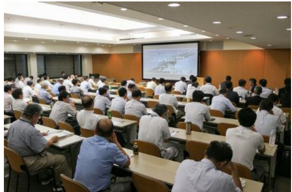
The symposium at JSCE HQ auditorium

International Activities Center hosted “Japanese Civil Engineers the Global Leaders Symposium Series No.10” at JSCE hall on August 3, 2017, as shown in the program below. The symposium was held under the theme of the construction project (yen-loan project) of the 15.6km-long road and bridge which is to serve as an access road for Lach Huyen Port, which currently is under construction. The purpose of the project is to accommodate increasing freight volumes. At the symposium, those from Japan-based Sumitomo Mitsui Construction Co., Ltd., who have been working at the