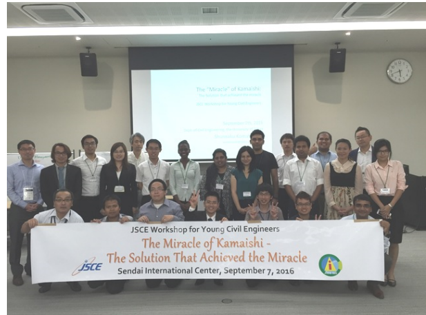
Participants in JSCE Workshop for Young Engineers

As the last event in the Int'l Program, a technical tour was carried out for the international students in the afternoon of the 2 nd day. Participants visited Sendai International Airport that has been reconstructed after the Great East Japan Earthquake, Tohoku University International Research Institute of Disaster Science (IRIDeS), Tsunami Tower Shelter, and Millennium Hope Hills. The participants learned and experienced natural disasters and disaster prevention and mitigation measures at first-hand in those two days.