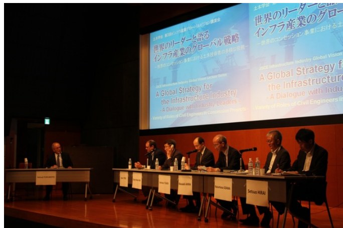
The situation of panel discussion

JSCE Global Vision Seminar Series No. 3 was held on October the 3rd, hosted by the Construction Management Committee and the International Activities Center (IAC). The author of this report was transferred to the Japan Society of Civil Engineers (JSCE) and engaged in the planning of the Lecture as the secretariat until the end of September, hence writing this report. The Lecture was a huge success, attended by 207 paid registrants.