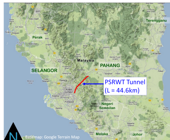
Fig.1 Tunnel Location (Pahang State and Selangor State, Malaysia)