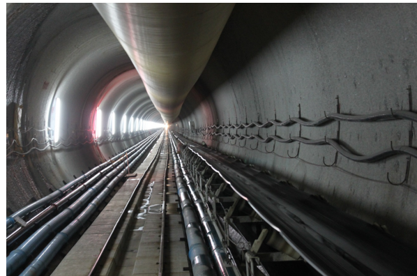
Fig.4 General View of TBM section