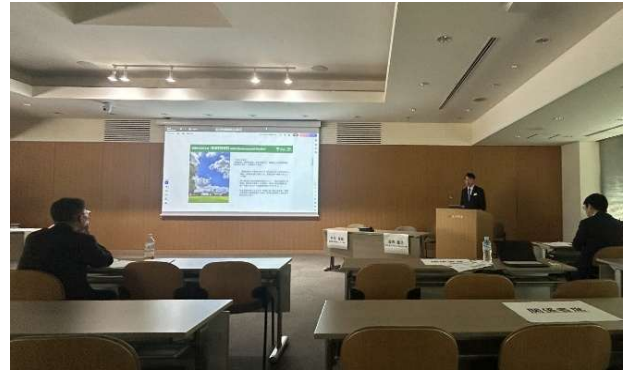
Audience at the venue

The Project Work Group of the JSCE Intl. Activities Center also publishes information on the Japanese Civil Engineers the Global Leaders Symposium Series and the Archives of International