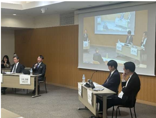
The Panelists at a Q&A

The keynote speeches on the topic of SDGs were very accessible and also introduced the efforts of the United Nations Centre for Regional Development. I think this seminar was a great success, not only in terms of attendance, but in terms of what it delivered as well.