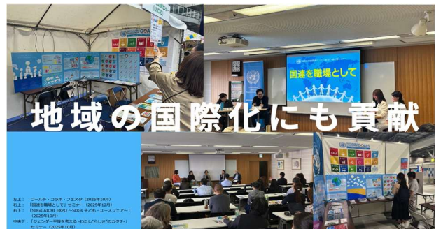
Introduction of UNCRD