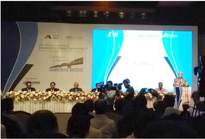
IABSE-JSCE Joint Conference in Bangladesh, 2015

As part of the information dissemination activities, electronic archives of publications edited by the Committee on Steel Structures or its research and studies sub-committees, collections of conference proceedings, etc., have been prepared and can be downloaded as electronic files from the committee website, so that the results of the committee's activities are widely publicized.