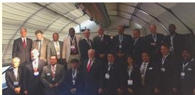
Attendees at the International Luncheon