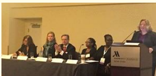
Concurrent Session "Diversity & Inclusion in Civil Engineering: Opportunities, Innovations & Best practices"

The convention offered many concurrent sessions. I attended "ASCE 2013 Report Card: Have We Raised Our Infrastructure Grades?" and "Diversity & Inclusion in Civil Engineering: Opportunities, Innovation & Best Practices." The latter session had presentations and discussions on how leading civil engineering employers were leveraging diverse workforces and community engagement initiatives to implement ground-breaking innovations in civil engineering technology.