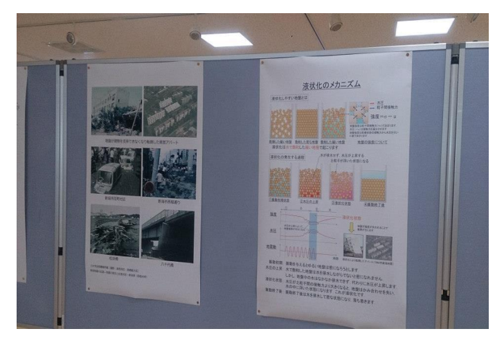
Panels exhibited at 2014 JSCE Earthquake Engineering Symposium

The committee will continuously provide a variety of