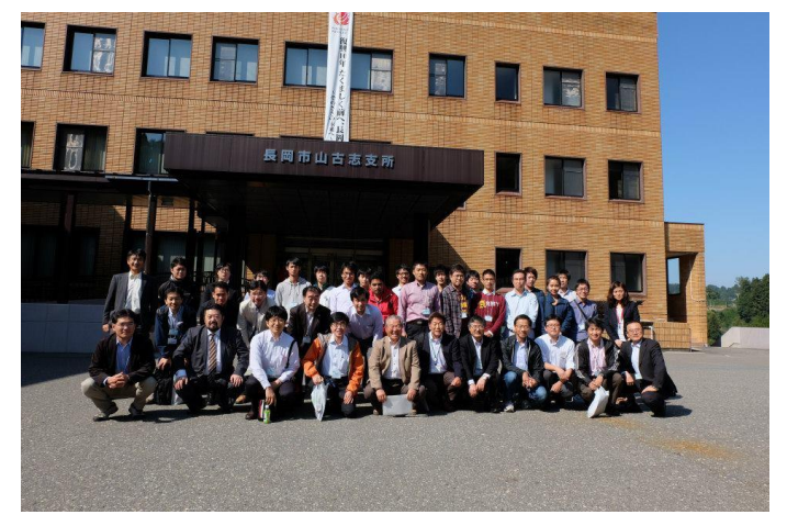
Participants in the field survey trip after 2014 JSCE Earthquake Engineering Symposium

information to Japanese and overseas researchers. We will make further efforts to compile information on past earthquake damages and its lessons, improve earthquake design standards, and encourage young researchers to engage in cross-disciplinary activities.