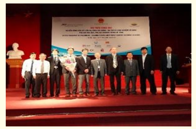
Group photo of the JSCE-VCA Joint Seminar Speakers

(<u>http://www.jsce-int.org/node/370</u>)