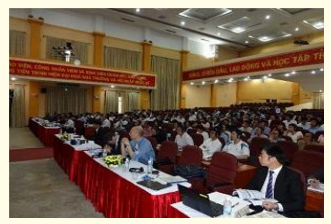
JSCE-VCA Joint seminar opening

During the discussion period, many topics of high concern for Vietnamese engineers regarding developing technologies were discussed. These topics included a new theoretical chemical admixture for use as an accelerator, agendas for Vietnam to establish design codes on the durability of concrete structures built using admixtures, mix design and strength design specifications for