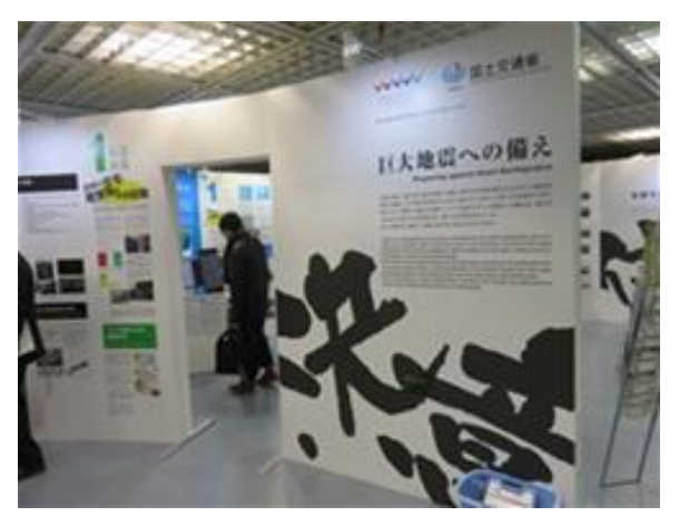
MLIT's disaster-reduction-themed exhibition.