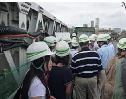
The international guests listen to NEXCO engineers at the Keiyo Junction.

In cooperation with East Nippon Expressway Co., Ltd (NEXCO EAST) the IAC organized a construction site tour for the international guests. The tour visited the under-construction Keiyo Junction on Tokyo Outer Ring Road, and Hamacho South Viaduct on Higashi Kanto Expressway to see state-of-art construction technologies, maintenance and inspection techniques and facilities. The participants showed keen interests in those latest civil engineering technologies, made many questions to NEXCO engineers and took photos of those sites, facilities and machineries.