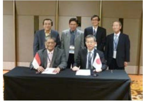
(Photo 3) JSCE signs an Agreement of Cooperation with the Indonesian Society of Civil and Structural Engineers