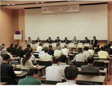
Panelists exchanges opinions with each other.