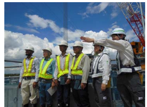
Shin-Katsushika Bridge by NEXCO EAST (Steel Superstructure Work)

They confessed to being profoundly impressed by Japan's high standard of quality control and civil engineering technology at the bridge and road constructions sites managed by NEXCO EAST. They noted the importance of fundamental research as well as state-of-the-art technology through the tours to Public Works Research Institute and Kajima Research Institute. They also visited Tokyo Institute of Technology, where they interacted with Japanese and foreign students, exchanging stories on their daily lives and talking about future dreams, among other things.