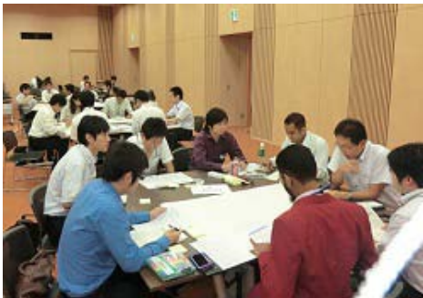
Young engineers share their ideas with their international peers.

Workshop for Young Engineers was held as a preliminary meeting of “International Workshop for Young Engineers” to be held as part of JSCE’s 100th anniversary celebration events. 33 participants, who were Japanese and international university students, young researchers and engineers, were divided into 6 groups and discussed their career goals and contributions to society as civil engineers, focusing on the theme “Your Career as a Civil Engineer and Our Future Society.” All participants made a one-minute-speech after the group discussion.