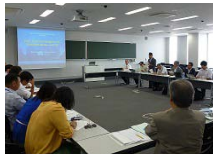
IAC executives and Int'l Sections at the meeting