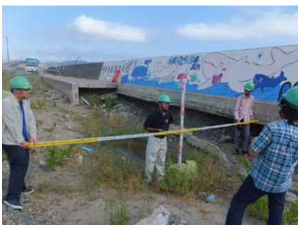
Tsunami damaged area in Ishinomaki City

Furthermore, the tour this year included a visit to areas in Miyagi affected by the Great East Japan Earthquake. Although tsunamis are less common in their home countries, they were stunned when they saw a toppled concrete building at one of the sites in Onagawa. One of the students gravely conveyed his feeling of concern about future possible disasters in his country after learning of the situation in Tohoku.