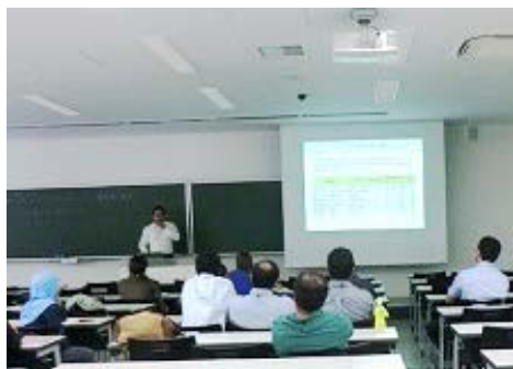
A speaker delivers a presentation.

The 15th International Summer Symposium was held over three days. It was organized as one of technical sessions in the Annual Meeting. 67 papers were submitted, and 67 speakers, who were mainly international students and engineers studying or working in Japan, delivered presentations in the sessions which matched their specific interest among 12 sessions. Looking at any session, the participants appeared enjoying exchanging their views and ideas with each other and gaining new knowledge and information.