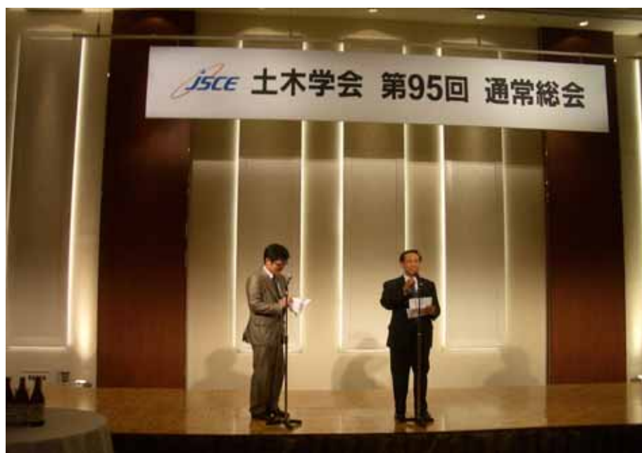
[Attendance on JSCE 95 th General Assembly]