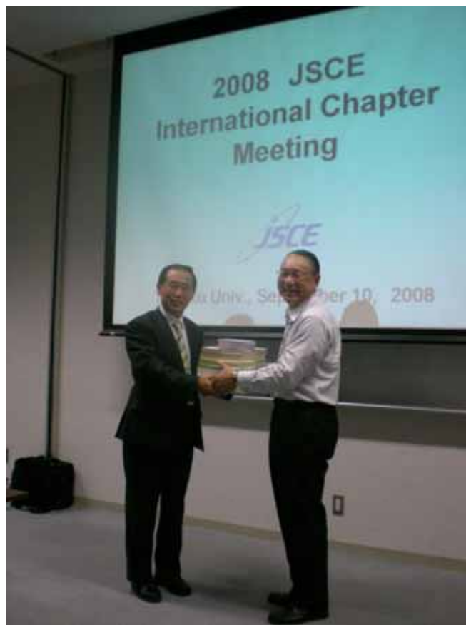
[Attendance on 63rd JSCE Annual Meeting]