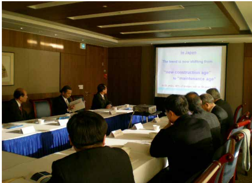
[Opening a seminar]