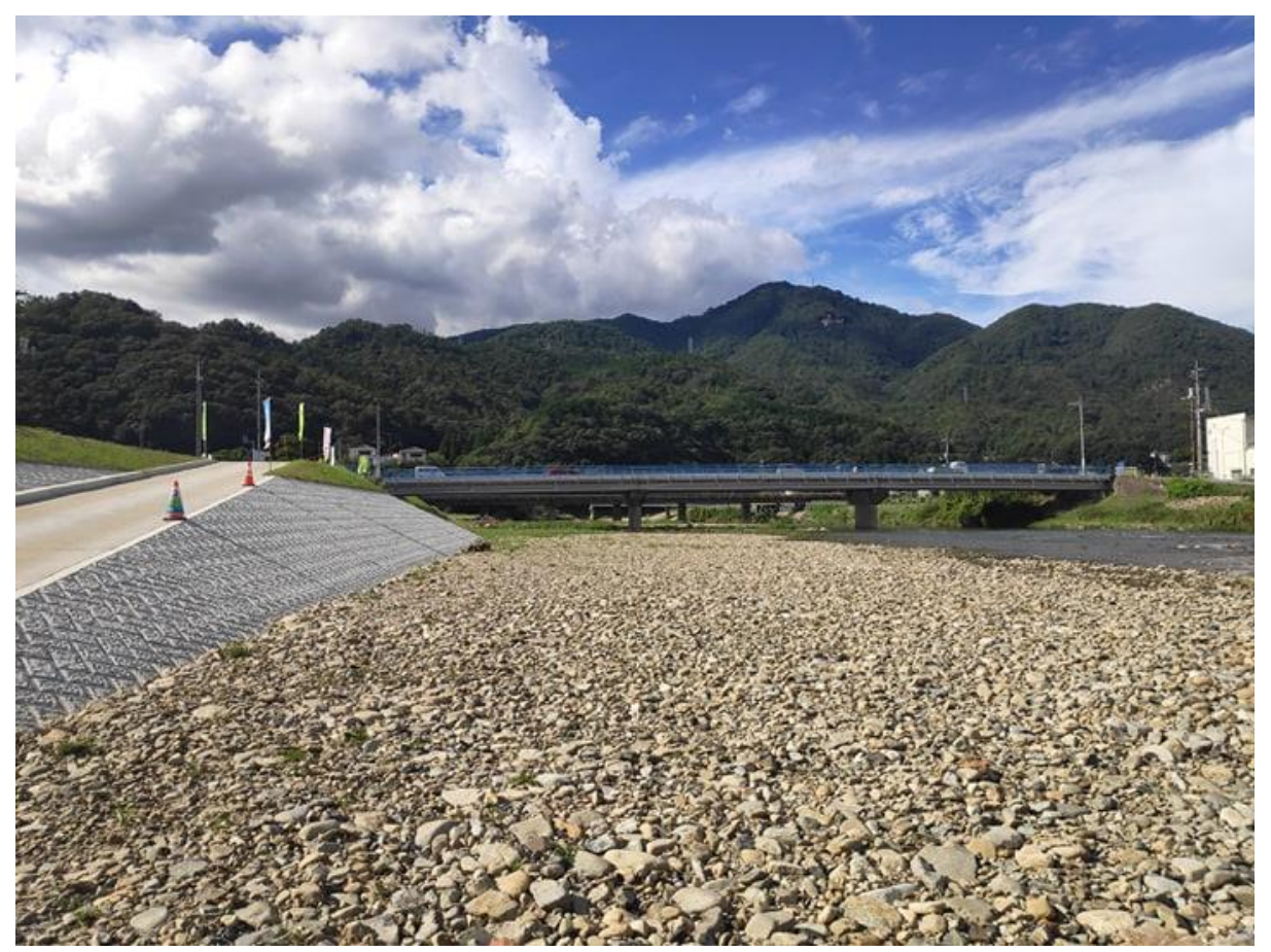
rain last July 07, 2019 and will be fully restored by the end of December this year.

After we visited to Hiroshima memorial park, we visited to disaster affected area on Misawa River. The river got damaged because of heavy rainfall from the previous site we earlier visited, the right-bank stretch of Misasagawa River was even devasted by heavy