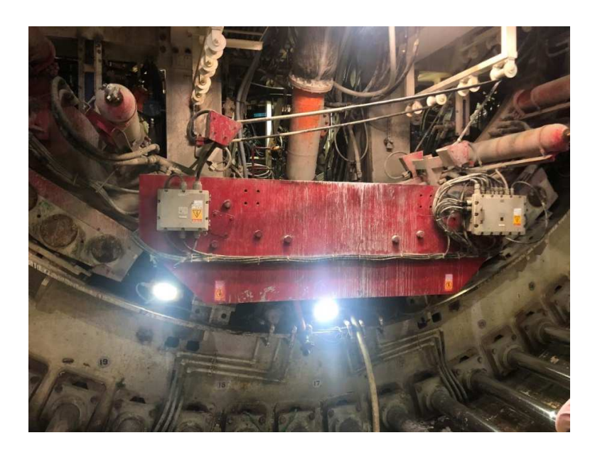
Figure 6. Photo inside the Tunnel Construction Site under Tokyo Airport 2.4) Day 3-September 3<sup>rd</sup> 2019

In the morning of our 3<sup>rd</sup> day of the Study Tour, we left early in the morning to Kagawa University to attend the 21<sup>th</sup> International Summer Symposium, organized by JSCE. We participants were divided into different venues to deliver our presentation. I was in the same auditorium as Ms. Gul and Mr. Omar. My presentation was "Bridge damages and maintenance methods in Vietnam", in which I briefly introduced the data gathered about the damage types and effective methods currently being used in Vietnam to repair and replace the damaged areas. It was an excellent chance for me to discuss and share my experiences with the rest of the presenters and get to know some of them later.