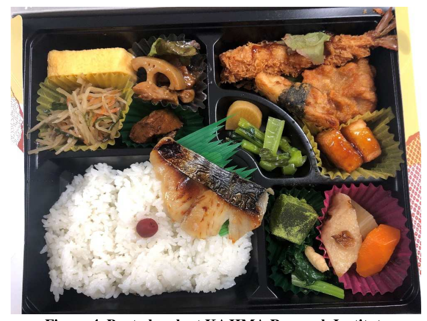
Figure 4. Bento lunch at KAJIMA Research Institute