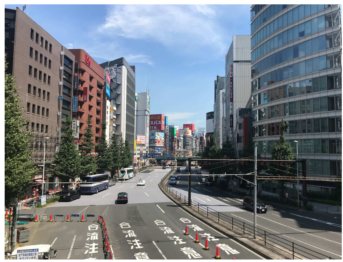
Figure 2. Shinjuku view from the shuttle bus

I arrived at Narita International Airport by 7 a.m September 26<sup>th</sup> 2019. After my arrival, I was guided to the shutter bus to the city center along with Mr. Washirawat and Mr.Aung. It took more than 1 hour for us to reach Tokyo Shinjuku Station and we were greeted by Ms.Suzuki, who took us back to the hotel to check in. We were already excited about the programs ahead.