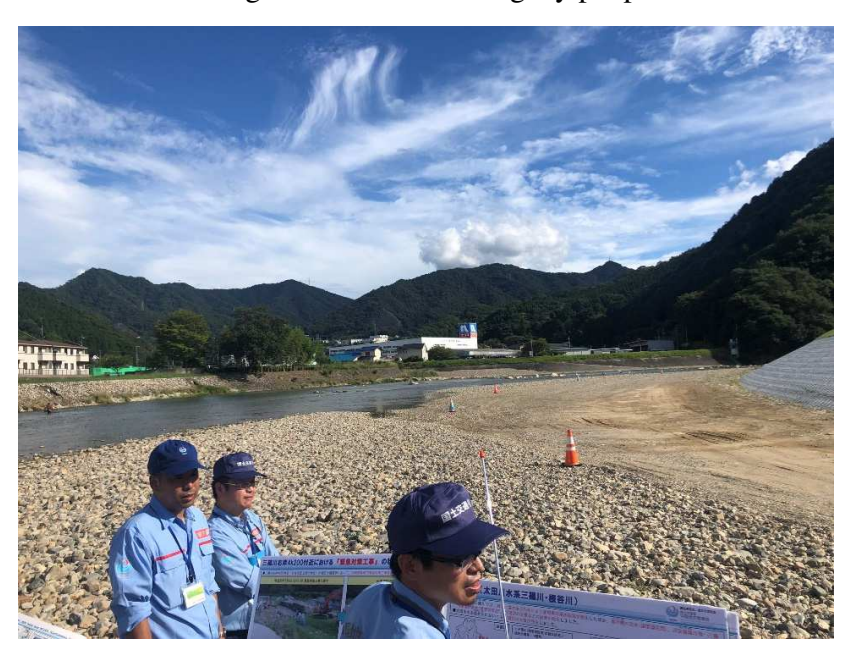
Figure 15. Misawa River damaged affected areas

The day was packed with tight schedule, we visited 6 different locations including Disaster Waste Disposal Sites, Area affected by Sediment-Related Disasters, Damaged areas on National Highway 31, Temporal Housing in Sakacho, Misawa river damage affected areas and Torigoe Bridge and Water and Sewage Pipes. In the afternoon we also visited Hiroshima Peace Memorial Park, where I learned a lot from the Atomic Bombing Incident and the tragedy people had to suffer.