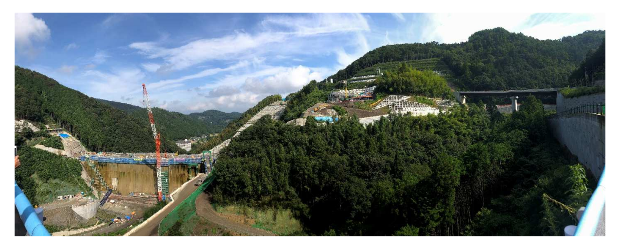
Figure 12. Kabagawa Dam Construction Site, Takamatsu, Nagawa

After having breakfast, we got on the Technical Tour Bus with other members of the JSCE to visit the construction site of Kabagawa Dam in Takamatsu, Nagawa. We were introduced the construction method and expected time till completion of the dam. I was impressed by the grand scale of the construction site.