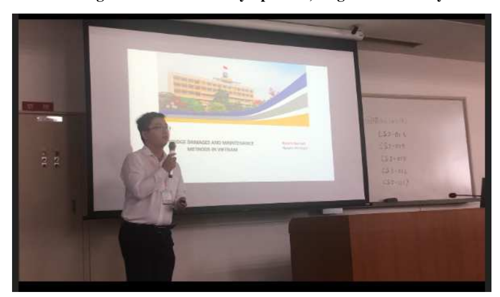
Figure 7. Photo at the Symposium, Kagawa University