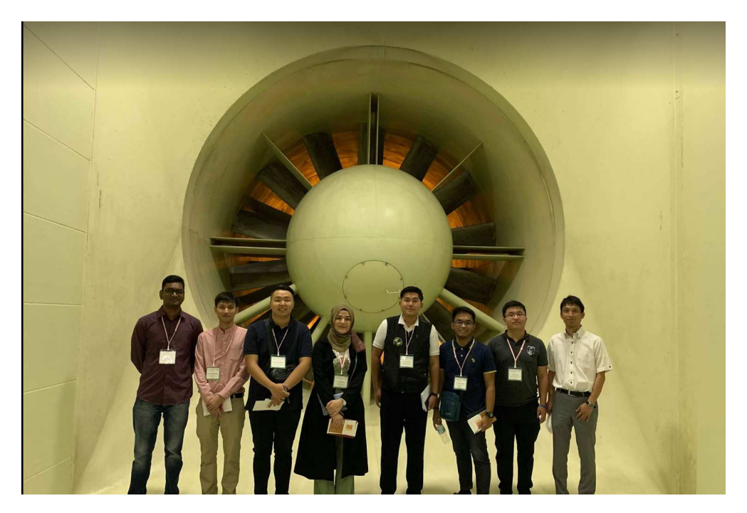
Figure 3. Participants in front of Wind Tunnel at KAJIMA Research Institute

buildings were used to test the effect of constructing high building to the surrounding area, in term of wind effects.