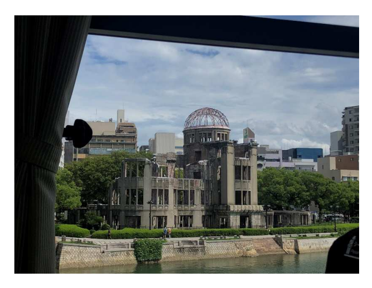
Figure 16. A dome damaged by the Atomic bomb