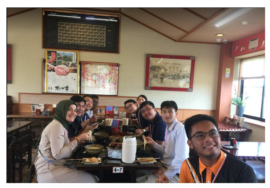
Figure 14. Udon restaurant

Then, the bus went to the Sanuki Mannou Park, which was an astonishing and beautiful park in Nagawa. For lunch, we had Udon traditional way. Everyone was enjoying themselves very much. After that, we headed for Hiroshima and took some pictures at Kurushima Kaikyo Bridge.