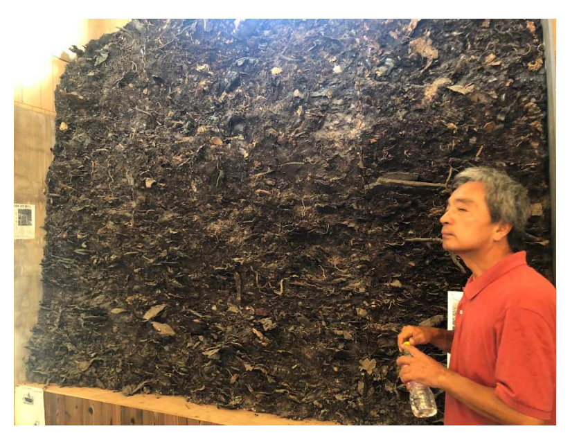
Figure 9. A fraction of the wall made from dumping waste

In the afternoon we went on a yatch to Teshima Island to visit the Illegal Dumping Site here, where we were told the origin and the crime against the environment as well as the protest of the people living here.