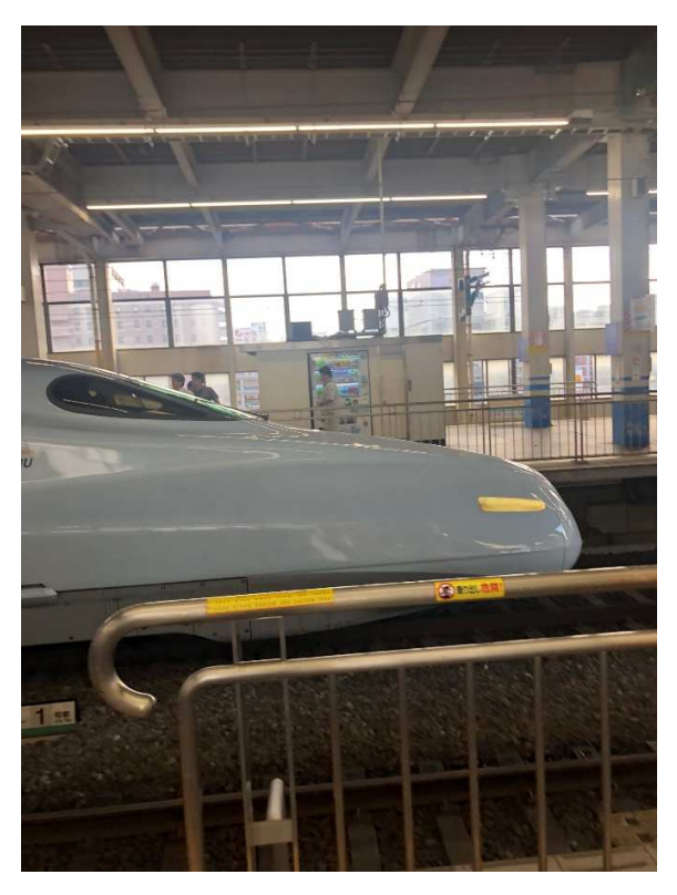
Figure 17. Sanyo Shinkansen, Hiroshima station