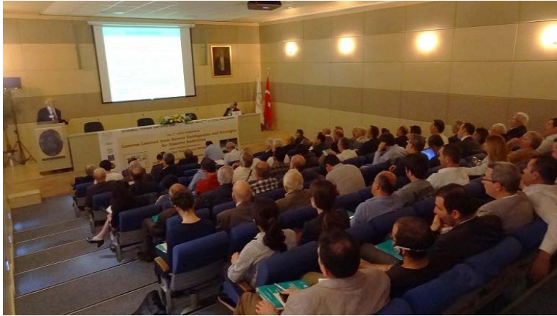
The 3 rd JSCE-TCCE-ITU Joint Symposium

Also, site visit to İzmit Bay Suspension Bridge construction site was conducted next day, with a group of 25 participants.