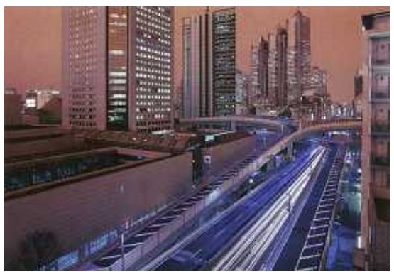
Nishi-Shinjuku JCT connects Shinjuku Route and Radial route No.4

Metropolitan Expressway Co., Ltd. is currently working on the completion of Central Circular Route as a primary countermeasure against traffic congestion in the Tokyo metropolitan area. Since the construction work began in 1994, about two-thirds of the section of Central Circular Shinjuku Route consisting of west part of the Central Circular Route (between the JCT of radial route No.4 and 5, length of 6.7km), was finally opened in service on 22nd December 2007.