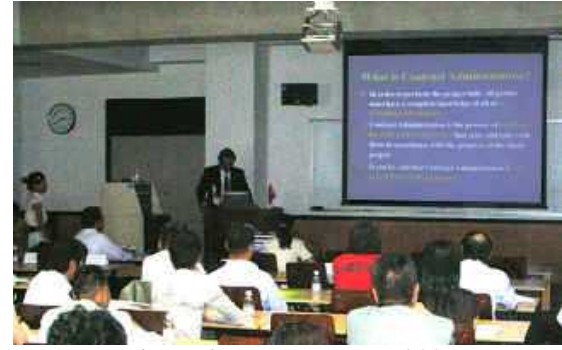
Phote of Joint Seminar in 2007

Date: November 13-14, 2008 Venue: Sydney, Australia