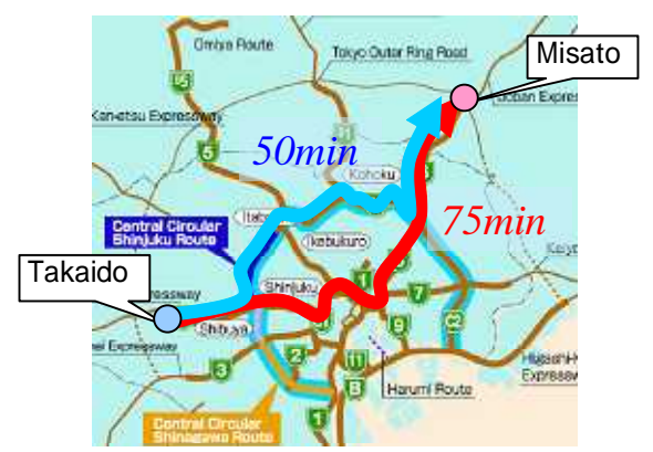
Improvement on traffic condition

Following the last year's opening of the route, the rest of the Shinjuku Route will be opened in two years (between the JCTs of radial route No.3 and 4, length of 3.4km). Furthermore, the Central Circular Shinagawa Route, which completes the construction of Central Circular Route, will be opened in five years. After the completion of the Shinagawa Route, the total length of tunnel section will be approximately 18km. The tunnel will be very unique in the world as an urban tunnel having such a long length. Therefore, safety control traffic control systems for the tunnel have been taken into consideration in the construction of the Shinjuku and Shinagawa routes.