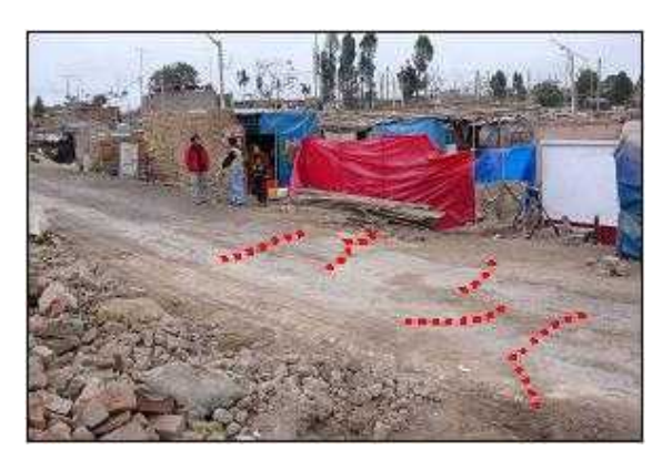
Figure 3. Ground tension cracks in front of collapsed houses

Full report is at following Website: http://shake.iis.u-tokyo.ac.jp/ Peru2007/ JSCE_JAEE_Report/Index.htm