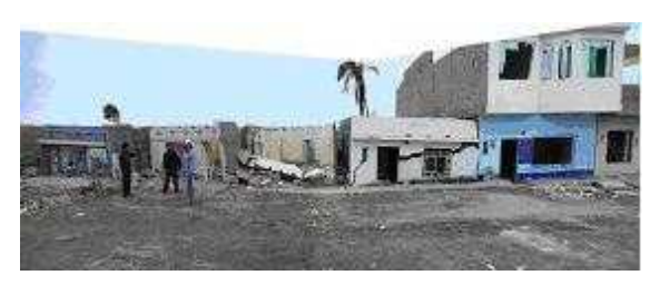
Figure 2. Building settlement of 0.7 m.

Inadequate land use is also an issue. Vulnerable areas in many cities have been already identified by programs such as the Sustainable City Program carried out by INDECI (Civil Defense). However, putting this findings into practice still takes too long time, therefore severe damage e.g. due liquefaction was observed both in Pisco and Tambo de Mora.