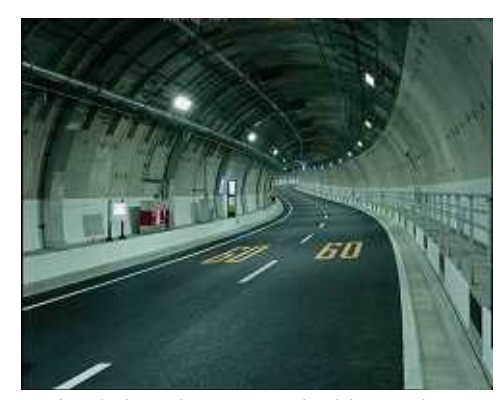
Inside of Shinjuku Route (Shield tunnel section)

Following the last year's opening of the route, the rest of the Shinjuku Route will be opened in two years (between the JCTs of radial route No.3 and 4, length of 3.4km). Furthermore, the Central Circular Shinagawa Route, which completes the construction of Central Circular Route, will be opened in five years. After the completion of the Shinagawa Route, the total length of tunnel section will be approximately 18km. The tunnel will be very unique in the world as an urban tunnel having such a long length. Therefore, safety control traffic control systems for the tunnel have been taken into consideration in the construction of the Shinjuku and Shinagawa routes.