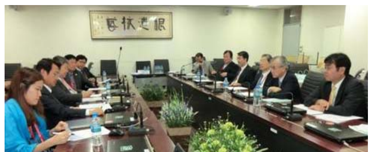
KSCE I-JSCE Meeting