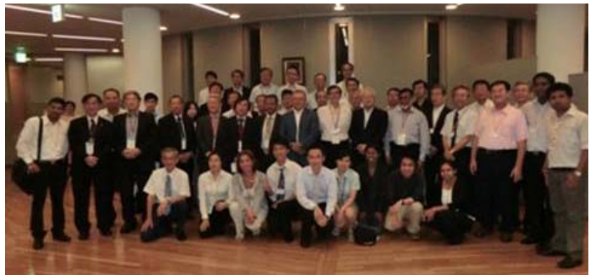
2012 RTM Participants