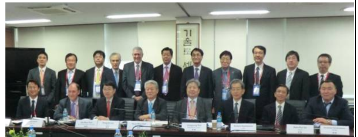
KSCE Int'l Roundtable Meeting Participants

http://committees.jsce.or.jp/kokusai/node/33 .