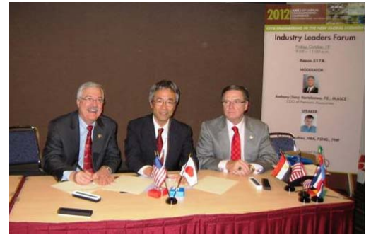
JSCE and ASCE signed an AOC Renewal