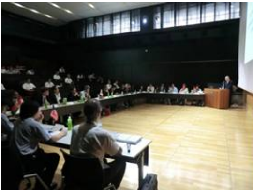
2012 JSCE Annual Meeting RTM

At the discussion on the 5 th , not only AOC representatives but also decision-makers for natural disaster mitigation and management policies exchanged information, ideas and views on earthquake, tsunami, flood, land slide, cyclone typhoons and others. They continued their discussion on the next day and considered disaster information collection and dissemination, disaster mitigation measures, systems, regulations and international cooperation, and reached an agreement to establish "Asian Board" so as to further their discussions every year. I was convinced that the discussion provided us with one opportunity for building multilateral cooperation in developing a disaster-resilient society. I look forward to seeing many Japanese civil engineers work for realization of such a society.