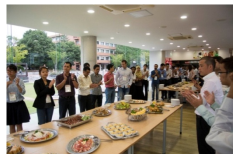
Photos from the workshop 2014, 2015, and 2016