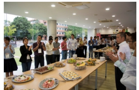
Photos from the workshop 2014, 2015, and 2016