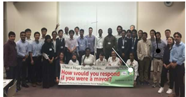
Participants at the Workshop Closing

Twenty-seven participants were divided into five groups, and they played the mayor of city damaged by a mega earthquake and tsunami disaster. Each group discussed Common Operational Picture (COP) and Incident Action Plan (IAP): in what situation the city should be in a week. Then, they reported the objectives, post-disaster policies and practices like a real mayor in a pseudo-press conference.