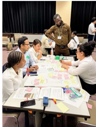
Participants Discuss Post-Disaster Policies