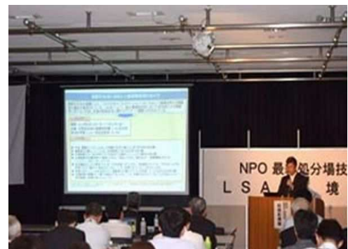
Photo 1 The 58th Symposium for Environmental Systems

The Committee on Environmental Systems holds workshops for presenting research papers on environmental systems once a year and a symposium for environmental systems and local symposiums several times a year (Photo 1). The purpose is to organize environmental system studies and disseminate researches, proposals, and practical reports that focus on building