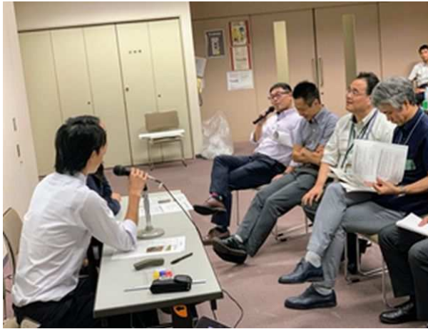
A Mayor Reports at a Press Conference