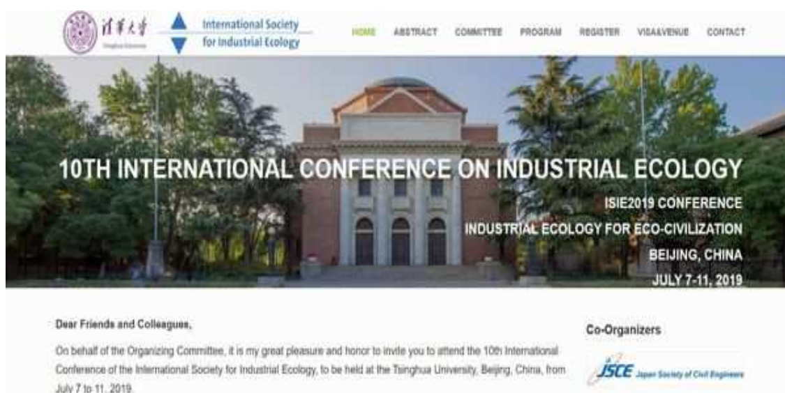
Photo 2 The 10th International Conference on Industrial Ecology

While the three subcommittees that support essential activities including thesis review, awarding, and digitization play a major role in the Committee, there are also other subcommittees that deal with themes such as environmental system business development, review of research on environmental systems, globalization, health and the environment, the SDGs, and symbiotic communities with regional circulation. They together work on promoting systematic researches and outreach, and exploring new frontiers. In particular, as part of international cooperation with the International Society for Industrial Ecology (ISIE), the ISIE 6th Asia-Pacific Conference (Tsingtao, China) was held in September 2018 and the ISIE 10th International Conference (Beijing, China) was held in July 2019 co-hosted with the Committee on Environmental Systems, JSCE (Photo 2).