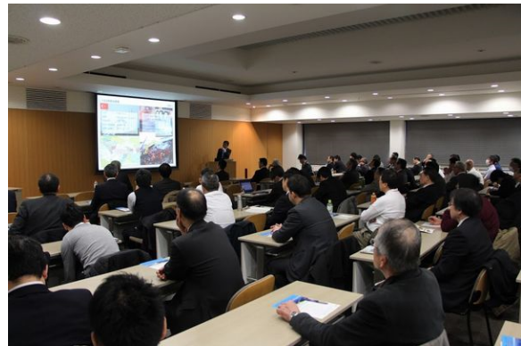
Participants attentively listen to the presentation at the JSCE HQ, Tokyo

Izmit Bay is a narrow bay that extends as far as 40 km eastward from the Marmara Sea. This has been a major obstacle to traveling from Istanbul to Izmir, the third largest city in Turkey. The new 3-km-long bridge has reduced the traveling time taken to cross the Bay from 90 minutes by land and 60 minutes by ferry to just 6 minutes. When the expressways at both ends are completed, the time between Istanbul and Izmir will be reduced from 10 hours to 3.5 hours. The project will have a very large economic impact. With a total bridge length of 2682 m and principal span of 1550 m, it is the fourth longest suspension bridge in the world.