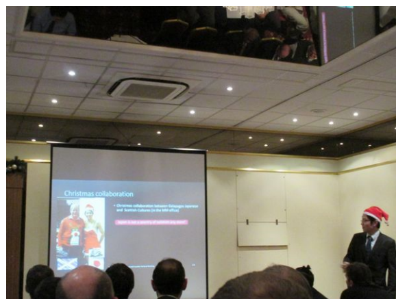
Presentation at the Evening Technical Seminar

The author agreed to give a talk on the topic related to Japanese bridge design and engineering since civil engineers in UK were not familiar with this topic, and the author wanted to assist Japan’s initiative to export their civil engineering infrastructure system outside the county.