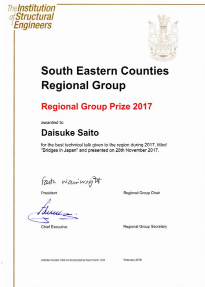
The author won the Regional Group Prize 2017

It appeared that most of the technologies introduced in the presentation were not known by the attendees; many queries and positive comments were received. The author ensured strong interest in Japanese technologies from the audience in general – however the author was at a loss for an answer to the following question: "How do you adopt these advanced technologies from Japan in our UK civil engineering projects, is there any good way forwards?". The adoption of Japanese technologies in UK projects may not be straight forwards; however, the strong interest from UK engineers in Japanese bridge technologies shows potential for the future. If the Japan Society of Civil Engineers (JSCE) can exchange their engineers and technical information more with their International counterparts such as the ICE and the IStructE, this should enable Japanese civil engineering technologies to be promoted more widely outside the country. I would hope to see that the "Galapagos syndrome" associated with Japanese civil engineering to gradually diminish in the future through the JSCE's efforts.