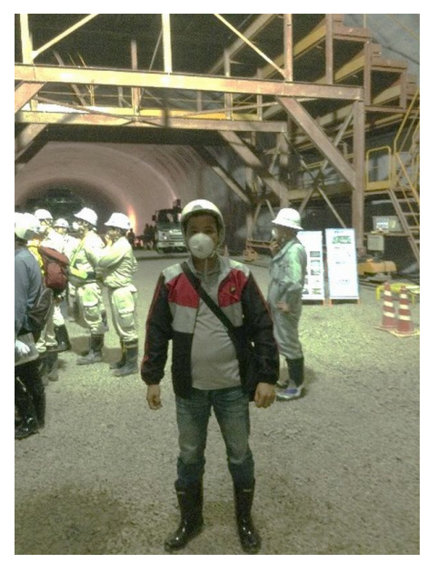
A Tunnel Construction Site in Hokkaido in 2014