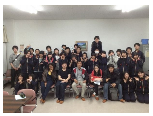
Global Village 2014 in Hokkaido

In the geotechnical laboratory in Hokkaido University, I was lucky to meet outstanding academic staff and research students who had very unique characters and avidly pursued new knowledge and I enjoyed living studying, and researching there. Also, my adviser was very kind to