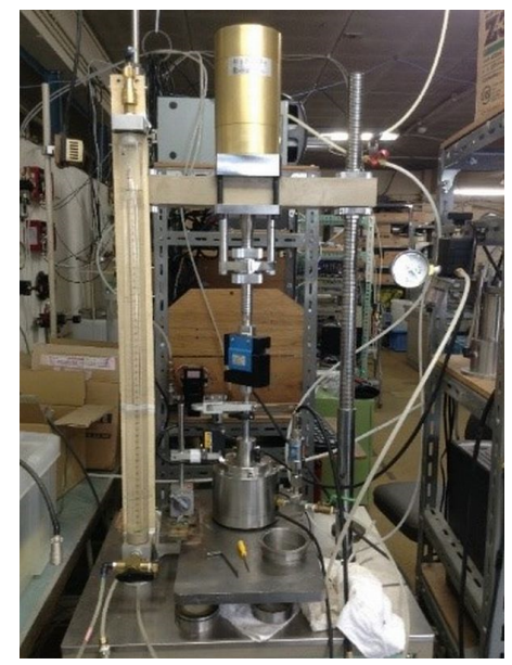
Confined Swelling Oedometer Test on Expansive Clay (Geotechnical laboratory, Hokkaido University, 2014)

support me not only academically, but also personally: he offered valuable advice and helped personal matters. During my time in Hokkaido University, besides conducting an experiment on confined swelling test of expansive clay, I had special lectures and hot discussions in various meetings and seminars relating to constitutive model research, effective stress principle and total stress method, and stress strain behaviors of soil all of which were fundamental researches useful for practicing geotechnical engineering. As a result of those experiences, I could understand the reasons why civil engineering, especially geotechnical field in Japan was highly advanced.