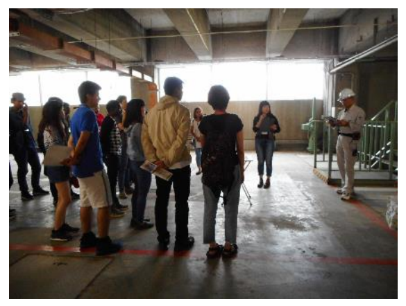
Site visit for Hokkaido Technical Tour for students organized by students at Hokkaido Univ.