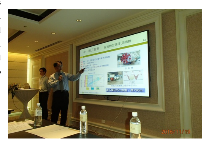
At the one of Educational Workshops (Underground Excavation)