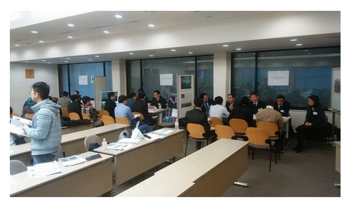
Individual consultations at the company booths

construction company Obayashi Corporation, spoke of his experience. At the second session, every participating company made a 10-minute presentation on its business operations, overseas projects, strong points, and recruitment of foreign students. The presentations were made by midcareer and young foreign staff studied in Japan and Japanese staff experienced in the international arena. The students intently listened to the briefings and collected information about