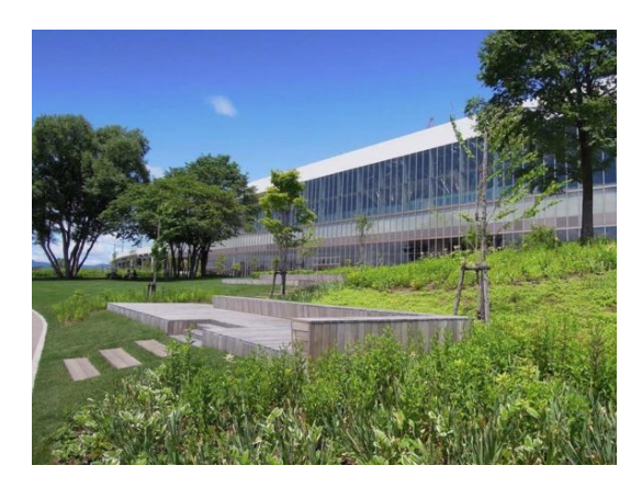
Civil Engineering Design Grand Prize 2015

The Improvement of Home River in Ichijodani Heritage (Fukui pref.)