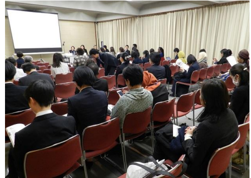
(Photo3) Participants from various countries.