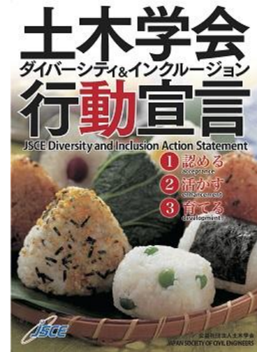
Fig.2 JSCE Diversity & Inclusion Action Statement

The Japanese society finally has started welcoming female civil engineers, and we are now heading to Diversity & Inclusion in order for us to serve the society with better infrastructures.