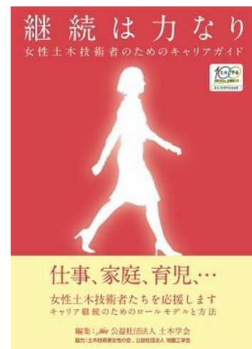
Fig.1 Career Guide for Women Civil Engineers

One of the major concerns that female civil engineers confront the lack of role models and understanding by their male colleagues. The book “A Carrier Guide for Women Civil Engineers” (Fig.1) was edited by the committee and published by JSCE as the very first publication for celebrating the centennial of JSCE. Ten role models along with the references of women in civil engineering are introduced in the book.