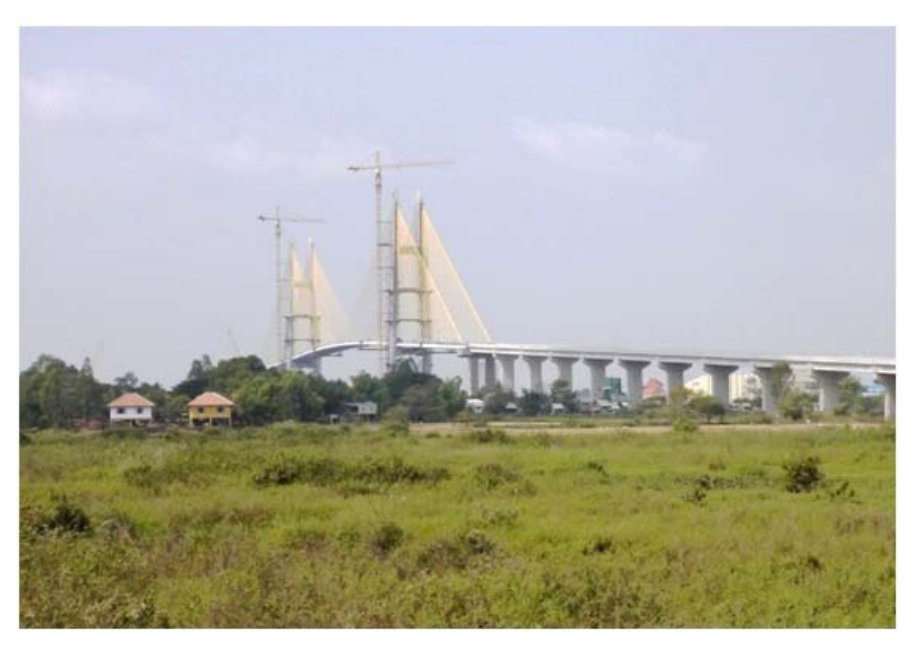
Photo 1. Neak Leoung Bridge in Cambobodia under construciton, which is implemented on an ODA grant-aid. The completion of the bridge will make significant contrituion to the revitalization of economic activities in the area along the South Economic Corridor of the Greater MeKong Subregion.

see the contribution of their works to that at the same time. Furthermore, they will become aware of the significant role of civil engineering in society, feeling the sense of pride and contentment welling up in them.