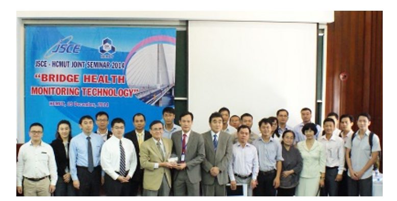
Participants and Faculty of HCMUT

The Vietnam Group considers that the seminar is the first step for future collaboration between Japan and Vietnam in the area of bridge engineering. Therefore, follow-up activity will be continued for tightening the collaboration, implementation of an actual project and deployment to various places in Vietnam.