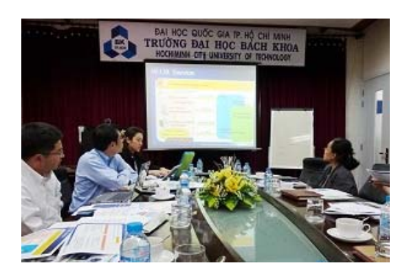
Closed Round-table Meeting

[Reported by Vietnam Group of International Activity Center, JSCE]