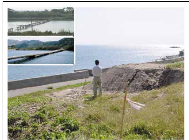
Photo-2 The left top is a flow bridge, the bottom is a submerged bridge. The girders of these bridges are drifted or submerged when the water rises, they come back easily when the water level lowers. These are typical of early evacuation models.

The place is the beach on Koshiki Island, Kagoshima Prefecture. Here an innovative small factory with a big dream was built. (TSUKADA Masahide, Civil Engineering Journal, Vol.88, No.9, 2003.9). When I explained that since the low atmospheric pressure of typhoons and that the weather in winter could be correctly forecast, if they adopted the early evacuation type, they would be able to lay intake pipes of the deep ocean water at one hundredth the cost of the conventional type, the local people, who had been considering the business by a governmental subsidy, said they could manage by themselves and started it promptly. Eventually it did not turn to be an early evacuation type, but it was completed considerably more inexpensively than the conventional type.